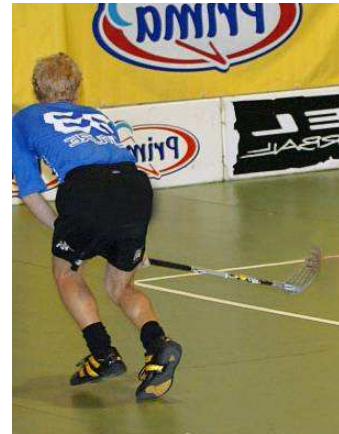
Using a left stick