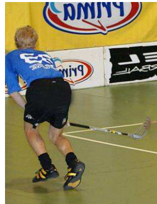
Using a left stick