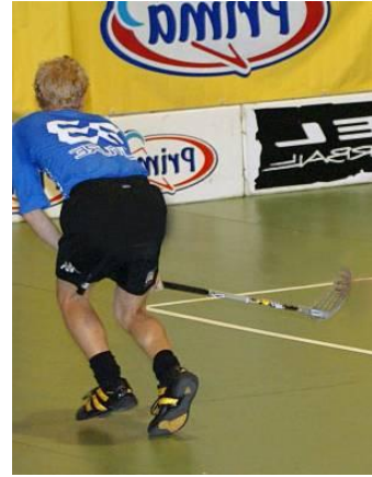
Using a left stick